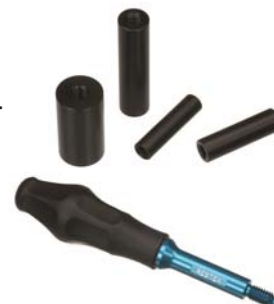
2-in-1 Filter/O-Ring Insertion Tool Kit

Push the filter to the bottom of the extraction cell.