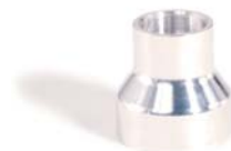
Funnel for ASE® 300