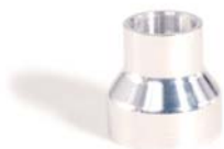
Funnel for ASE® 200