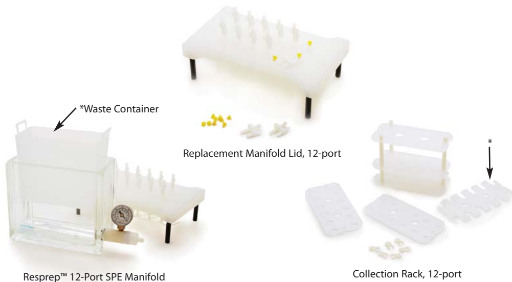
Resprep™ 12-Port SPE Manifold