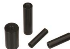
Filter Insertion Attachments