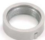
Cap Inserts for ASE® 200